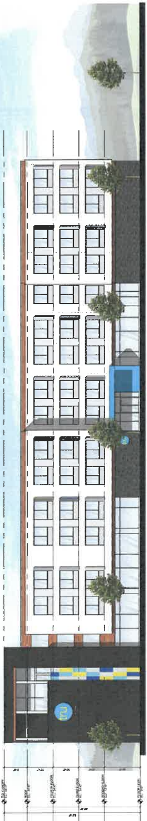
2 QUABERS STREET ELEVATION SCALE: 1/8" = 1'-0"