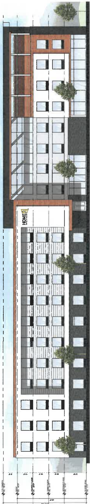
1 CLENDENIN STREET ELEVATION SCALE: 1/8" = 1'-0"